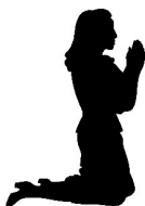
Freedom In Worship.

However, we must keep in mind that one can be free to be a Christian only by allowing the Bible to be his or her sole authority in matters faith. Since we will be judged only by the word of Jesus, then we are free in matters of faith to be accountable only to the word of Jesus. We must never forget what Jesus promised: “The word that I have spoken, the same will judge” everyone in the last day. 9 When people of faith establish the word of God as their only sure foundation in matters of faith, then unity among believers will prevail. But not only unity, one is set free in mind, knowing that he or she will never be judged by Jesus on the basis of some man-originated religious tradition, ceremony or behavior in worship. For example, if someone bows to his or her knees in prayer, this is a matter tradition. Such a practice cannot be bound on the consciences of others. Likewise, if someone raises his or her hands in worship, it is a matter of freedom. Such behavior cannot become a tradition to be bound on others. These are matters that have no authority in the word of God, and thus fall