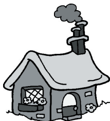
The Early Christians Met In Their Homes.

We would begin our search in the first century about two decades after the outpouring of the Holy Spirit on the day of Pentecost in A.D. 30. Those who became disciples then were first known as those of “the Way.” In fact, as recorded in Acts 9:2, when Saul—later Paul— went from house to house in the persecution of those who gave up Judaism, he searched for those who were of “the Way.” It was not until at least ten years later that those of “the Way” were called Christians in Antioch of Syria.