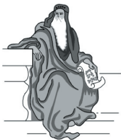
Prophecy Proves Christianity.

fulfilled all these prophecies, then we must conclude that He is the Christ (the Messiah), and thus, He must be believed. He must be accepted as the One who fulfilled all those Old Testament prophecies from Genesis 3:15 onward.