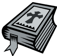
The Christian's Only Authority In Matters Of Faith!

For this reason, we, too, want to be Christians only. That's all. Nothing more. Nothing less. If one needs more than what God requires in the Bible to be a Christian, then he or she is seeking too much. In fact, it might be shockingly true in one's existing religiosity, that he or she feels right with God, but in reality he or she is not a Christian according to the definition of a Christian in the Bible. If our definition of being a Christian is less than what God explains in His word, then again, we will fall short of being a Christian.