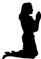
Freedom In Worship.

cannot be bound on the consciences of others. Likewise, if someone raises his or her hands in worship, it is a matter of freedom. Such behavior cannot become a tradition to be bound on others. These are matters that have no authority in the word of God, and thus fall in the area of freedom of choice.