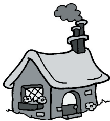
The Early Christians Met in Their Homes.

In fact, as recorded in Acts 9:2, when Saul—later Paul— went from house to house in the persecution of those who gave up Judaism, he searched for those who were of “the Way.” It was not until at least ten years later that those of “the Way” were called Christians in Antioch of Syria.