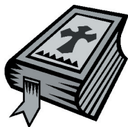
The Christian's Only Authority In Matters Of Faith!

But we must not be frustrated. In a world of conflicting and confusing religious beliefs and practices, anyone can be just a Christian. One can be just a Christian if he or she is willing to focus on the word of God as the only authority (dictionary) upon which we base our faith. What is very encouraging