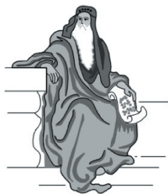
Prophecy Proves Christianity.

be incarnate in the flesh of man for the salvation of mankind. When the time was right in the history, therefore, the Son of God was incarnate in the flesh of man. The following is a list of only a few of the numerous fulfilled prophecies concerning the Son of God coming into this world: